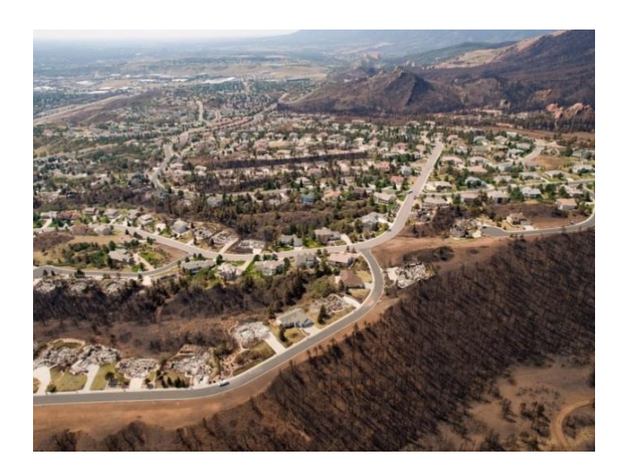
Wildfires become wildland-urban interface fires when they transition from natural areas of vegetation to a combination of vegetation and the built environment, such as the Waldo Canyon Fire in 2012.

The introduction and increasing growth of development adjacent to and intermixed within the natural vegetation across the landscape poses additional risk to people and property. In the context of wildfire, the combustible components of buildings, infrastructure, and associated accessories make them susceptible to ignition and are